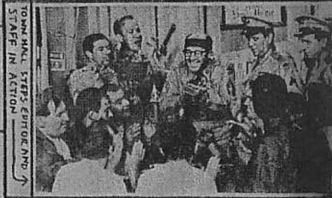
TOWN HALL STEPS EDITOR AND STAFF IN ACTION